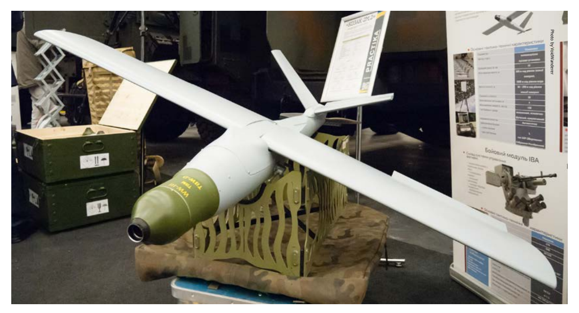
Warmate UAV, military fair, Kyiv, 2017

is the weapon's ability to 'loiter' in the air for an extended period before striking. Their operational utility lies in the fact that they are not aimed at a predefined target but rather at a target area.<sup>96</sup>