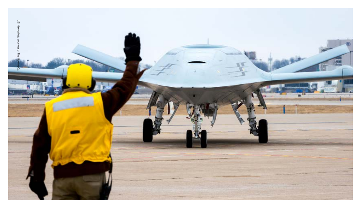
MQ-25 demonstration, 29 January 2018

Boeing's start-up focused investment group HorizonX Ventures has invested in SparkCognition , an AI company that works on swarm technologies.<sup>40</sup> It has also taken over a number of companies working on autonomous systems, including Insitu and Liquid Robotics (both covered below), as well as Aurora Flight Sciences , "to accelerate Boeing's development of game-changing autonomy technology for innovative aerospace vehicles".<sup>41</sup>